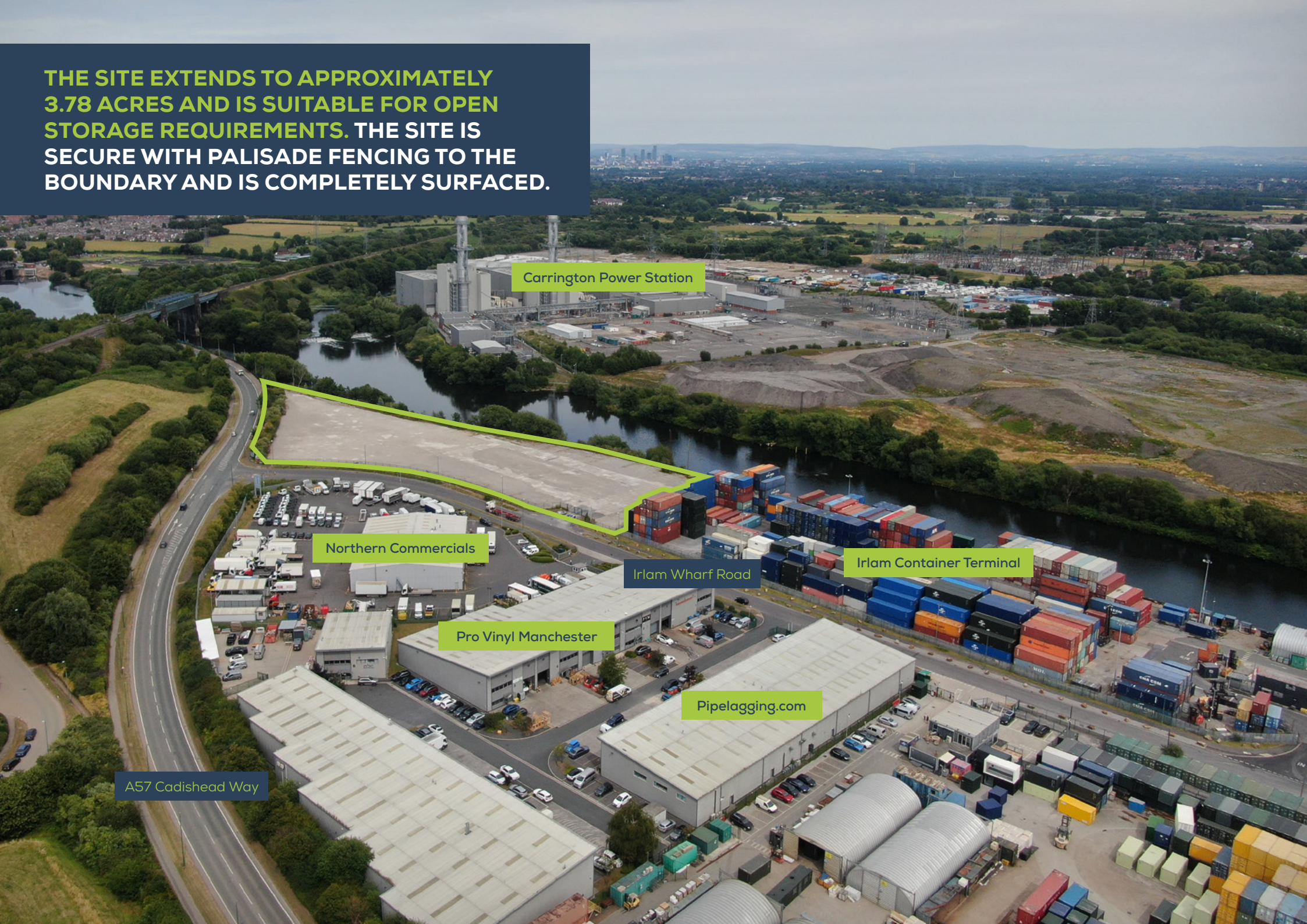
Carrington Power Station

THE SITE EXTENDS TO APPROXIMATELY 3.78 ACRES AND IS SUITABLE FOR OPEN STORAGE REQUIREMENTS. THE SITE IS SECURE WITH PALISADE FENCING TO THE BOUNDARY AND IS COMPLETELY SURFACED.